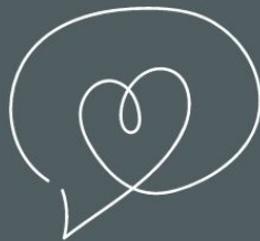
THE CAREGIVING SPOUSE